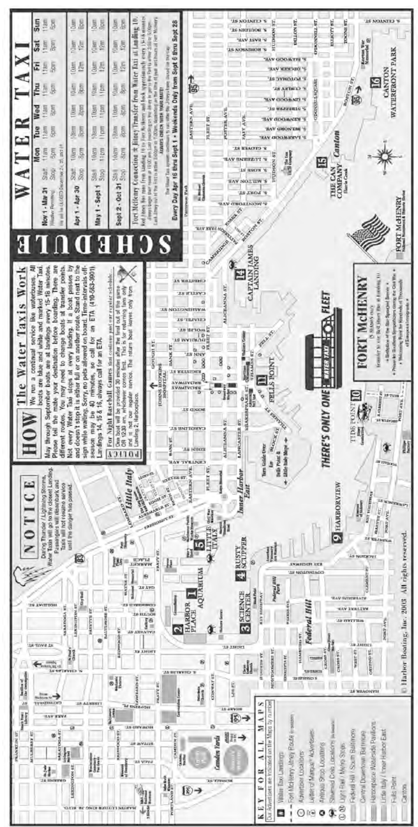
WATER TAXI AND BALTIMORE CITY MAP