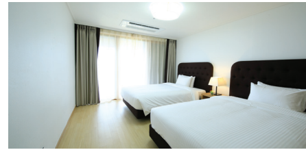
Jeju Booyoung Resort | Prestige