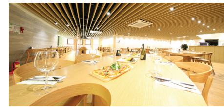
Pearl | Resort 2F