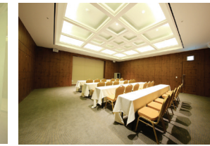
Board Room 3 | Hotel B1