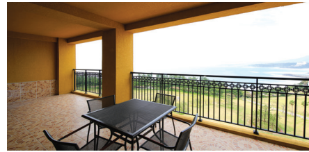
Jeju Booyoung Resort | Prestige Balcony