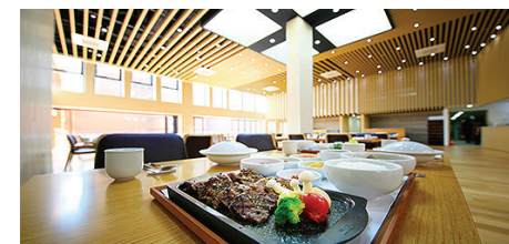
Wonang | Resort 3F