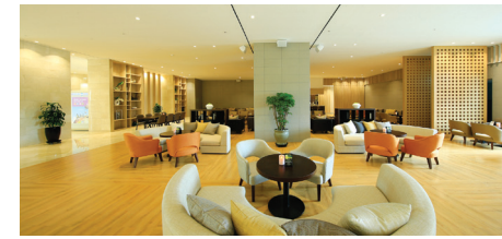
Ruby | Hotel 1F