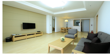
Jeju Booyoung Resort | Prestige