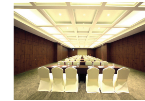
Board Room 1 | Hotel B1