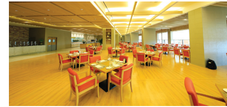
Diamond | Hotel 1F