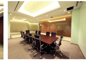
Board Room 2 | Hotel B1