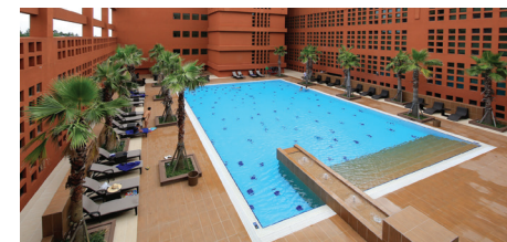
Pool-Side Snackbar | Outdoor Pool A, Resort